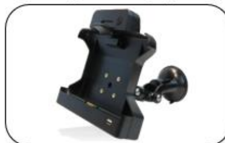
Vehicle Cradle (optional)