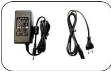
Adapter / AC Cord