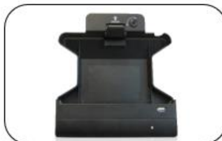
Desktop Cradle (optional)