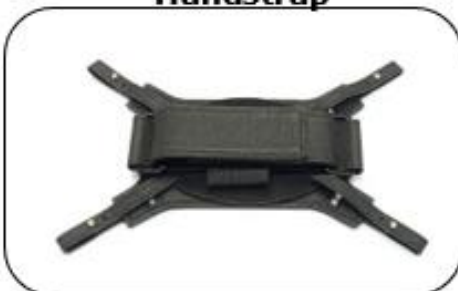
Rotating Handstrap (optional)