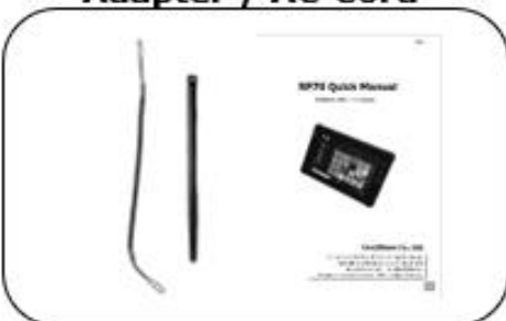
Stylus Pen, String, Quick Manual